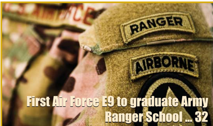
First Air Force E9 to graduate Army Ranger School ... 32