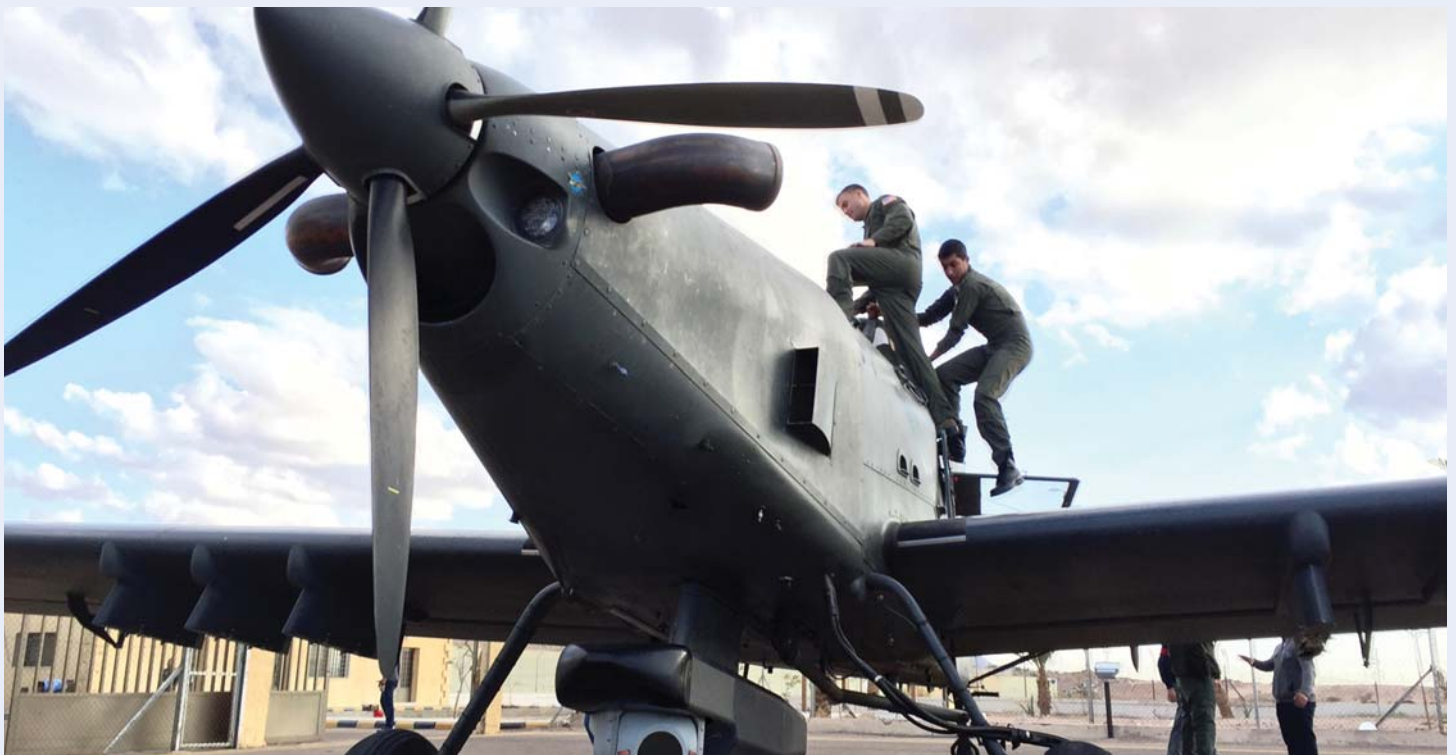
Combat Aviation Advisors help partner nation mechanics with aircraft engine maintenance during a deployed mission in March.