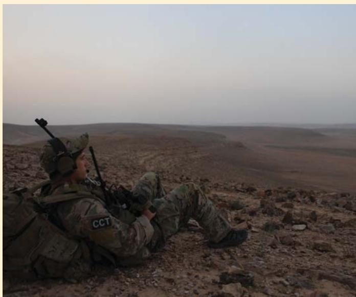
A combat controller surveys a valley during Exercise Eager Lion 2016, May 23.

Exercise Eager Lion 2016 consisted of simulated real-world scenarios to facilitate a coordinated partnered military response to conventional and unconventional threats. The addition of this SOF asset enhances U.S. and Jordanian effectiveness and capability to respond to real-world crises and threats.