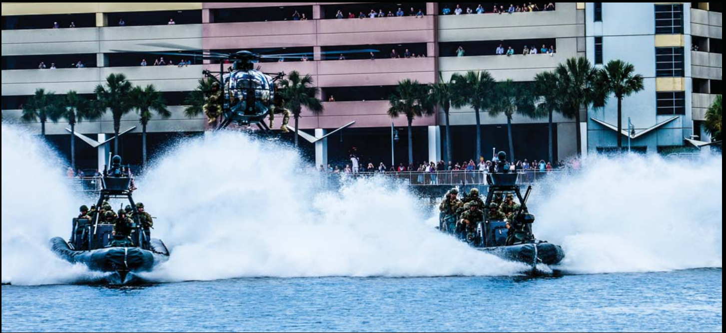
Two rigid-hulled inflatable boats and a MH-6 Little Bird approach the Tampa Convention Center during a capabilities demonstration in Tampa, Florida, May 25.