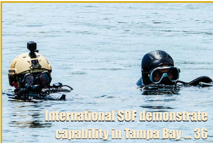
International SOF demonstrate capability in Tampa Bay ... 36