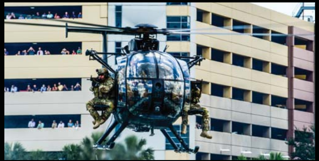
(Left) Two Navy SEALs climb a caving ladder boarding a cruise ship. (Above) An MH-6 Little Bird provides oversight of the cruise ship. (Below) A Special Tactics Airman parachutes into Tampa Bay. (Bottom) A Special Warfare Combat-craft Crewman fires a .50 caliber machine gun from the rigid-hulled inflatable boat.