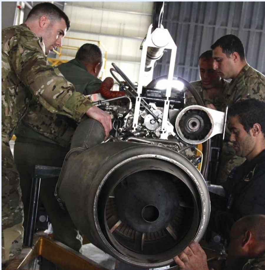
Combat Aviation Advisors help partner nation mechanics with aircraft engine maintenance during a deployed mission in March. A CAA deployment sends a small team of Airmen to assess, advise, train, and assist friendly and allied forces with their own airpower resources. Duke Field is the home of the only two CAA squadrons in the Air Force, the active-duty 6th Special Operations Squadron and the Reserve 711th SOS.

The work of the 6th SOS is mirrored by their Air Force Reserve counterparts, the 711th SOS. Executing the mission together helps create an even greater