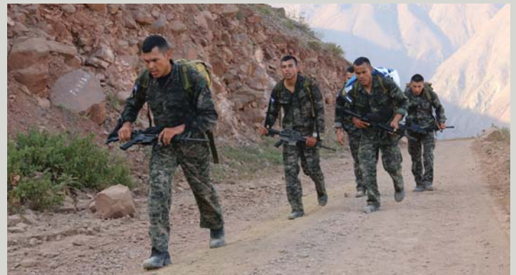
(Left) A U.S. Army UH-60 Blackhawk helicopter lands in preparation for Fuerzas Comando 2016, May 1 in Ancon, Peru. (Above) Competitors from Team Honduras march along a rugged section of terrain, May 9, Santiago de Tuna, Peru. (Below) A Mexican special operations competitor rounds a bend during the assault team event, May 4, in Ancon, Peru.