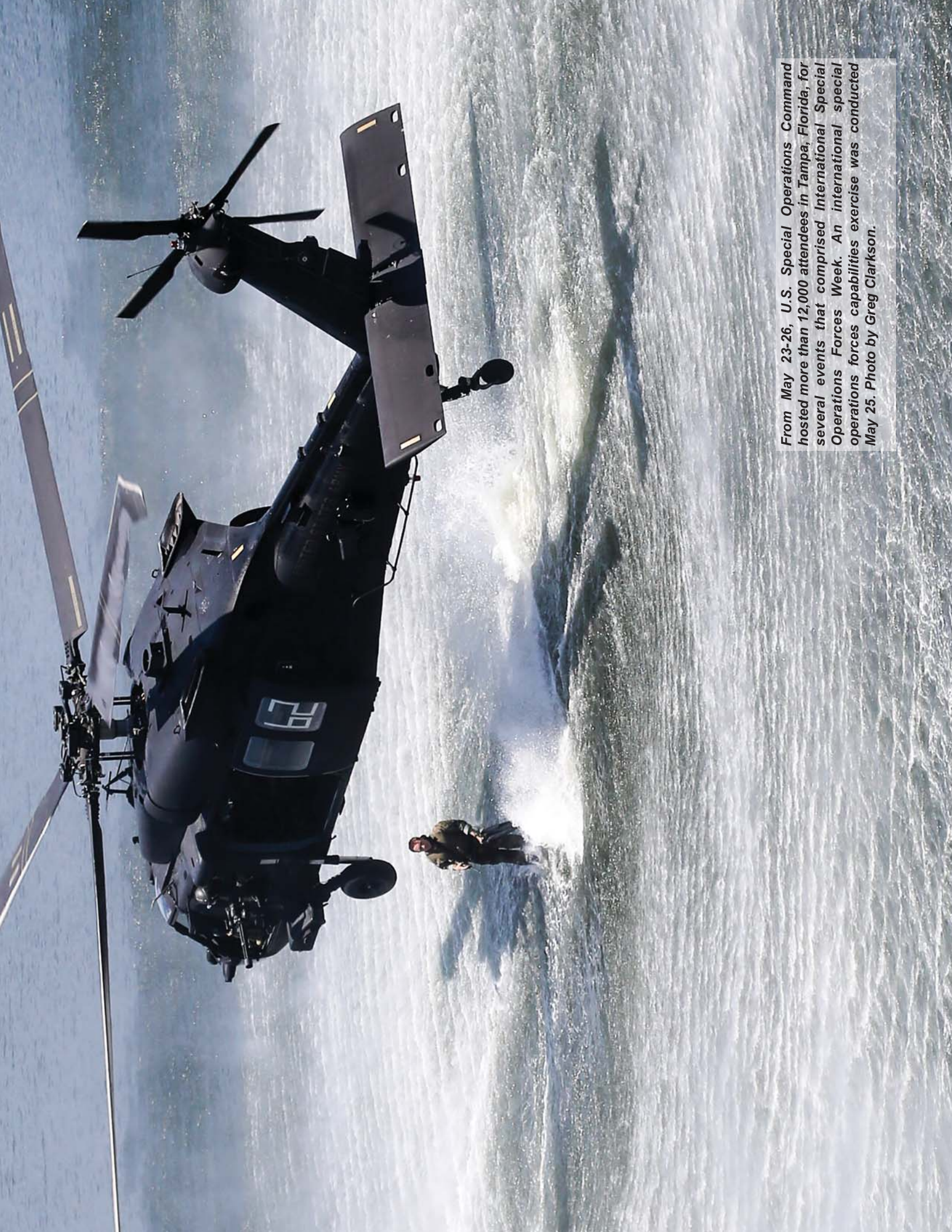
From May 23-26, U.S. Special Operations Command hosted more than 12,000 attendees in Tampa, Florida, for several events that comprised International Special Operations Forces Week. An international special operations forces capabilities exercise was conducted May 25.