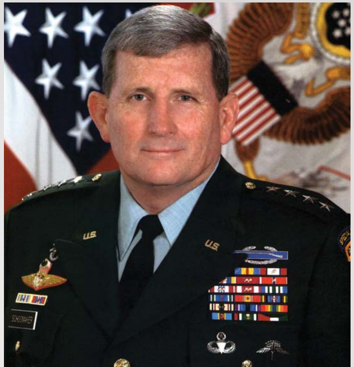
Gen. Peter J. Schoomaker.