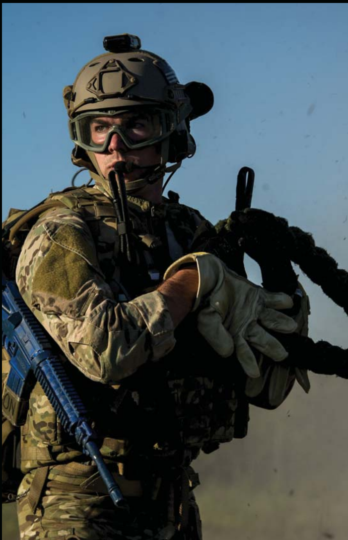
A Special Tactics Training Squadron Airman from the 24th Special Operations Wing pulls ropes from a U.S. Army UH-60 Black Hawk at Hurlburt Field, Florida, May 4, during Emerald Warrior 16.