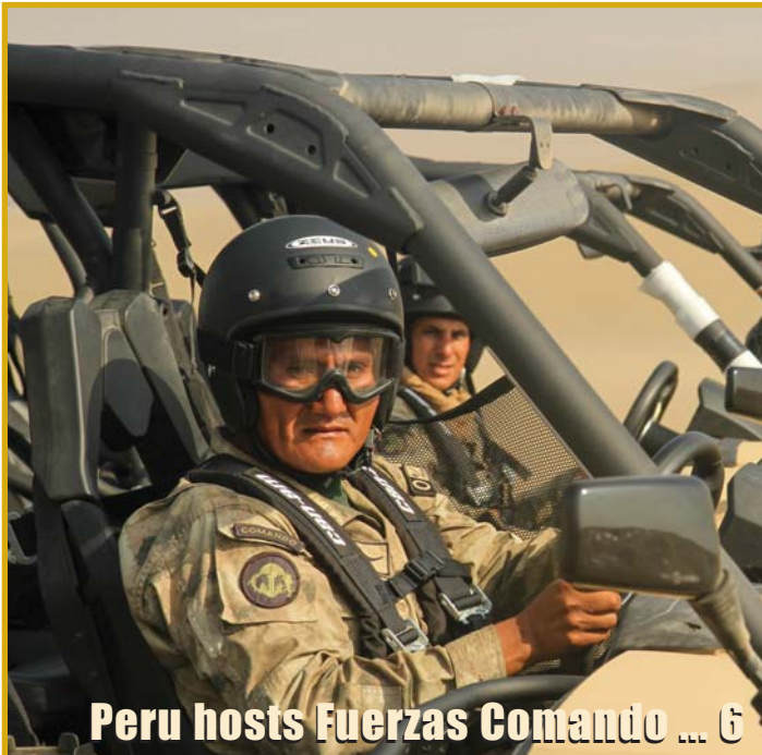
Peru hosts Fuerzas Comando ... 6