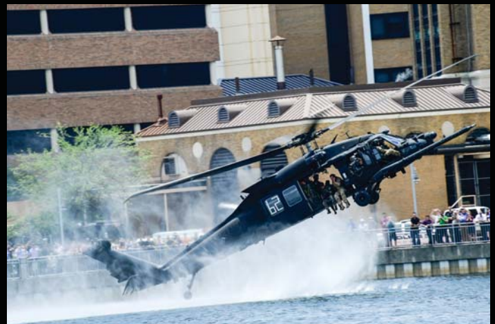
A MH-60 Black Hawk helicopter and crew take part in the capabilities exercise in Tampa, Florida, May 25.

The demonstration featured snipers on the roofs of