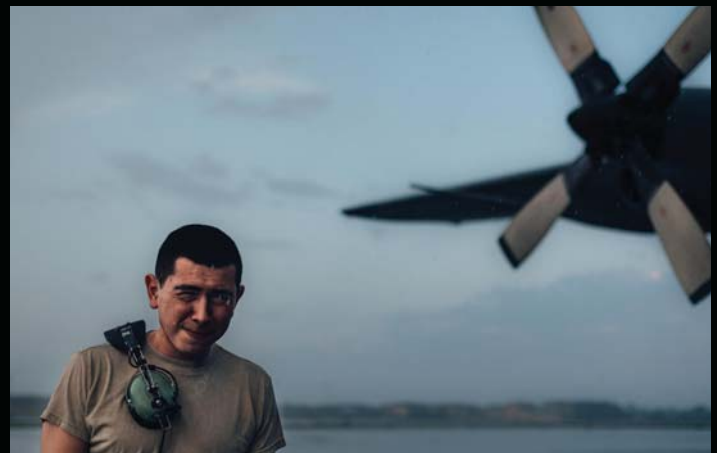
An Airman with the 1st Special Operations Aircraft Maintenance Squadron, walks to an AC-130U “Spooky” in a rain storm before preflight checks during Emerald Warrior 16 on May 3, at Hurlburt Field, Florida.